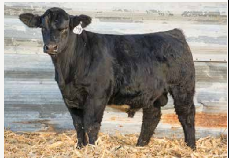
R/F Utah G398

- Great data makes sire selection predictable. F398 combines excellent growth and muscle with breed leading names on both sides of his pedigree. Predictability is bred into this good-looking Utah son. He will be sure to add stretch and thickness with a splash of maternal foundation into his progeny. Buy with confidence here, boys!