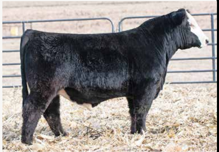
NPC Brock G910

Here is a _ blood baldy out of the great sire Relentless. His mother is a _ blood Broker cow that has been doing amazing job for us. This bull has style, soundness and a nice square hip. He will produce prodigy that will not only compete in the show ring but hang a great carcass as well.