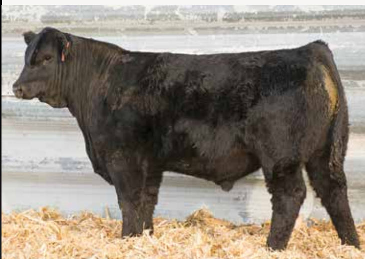
Zeis Blackhawk G239

Another high quality Stepping Stone son out of one of our best Dew it Right daughters. This hard to fault 5/8 bull is excellent in his structural integrity and muscle mass as well. Good udder quality and fertility for generations behind this bull.