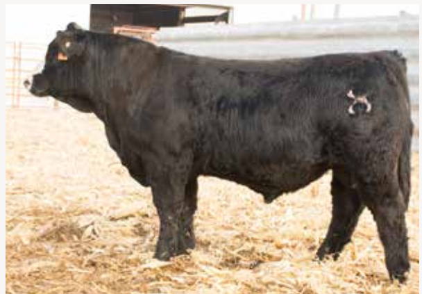
J&C Wide Range G981

A baldy Wide Range that is really beefy and thick from end to end.