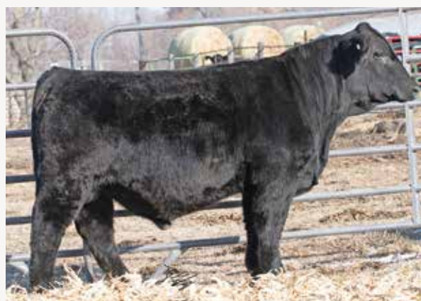
NPC Gino G925

G925 is an embryo calf that we purchased from B&L Cattle Co. & Naber Farms. He is chucked full of meat. He has rib, belly, and is massive. His growth numbers are massive as well. His mother goes back to the Hudson Pines cow Pep Y301.