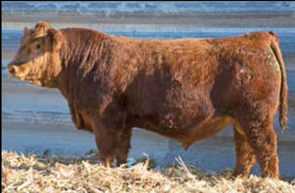
G227 – W/C Executive Order 8543B x CNN Special Moment 226Z