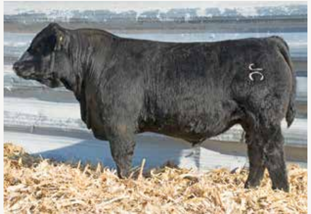
J&C Judge G521

All black Judge that's got the biggest behind on the place. He is deep, thick, and rugged as they come with a 1500+ yearling weight; small scurs