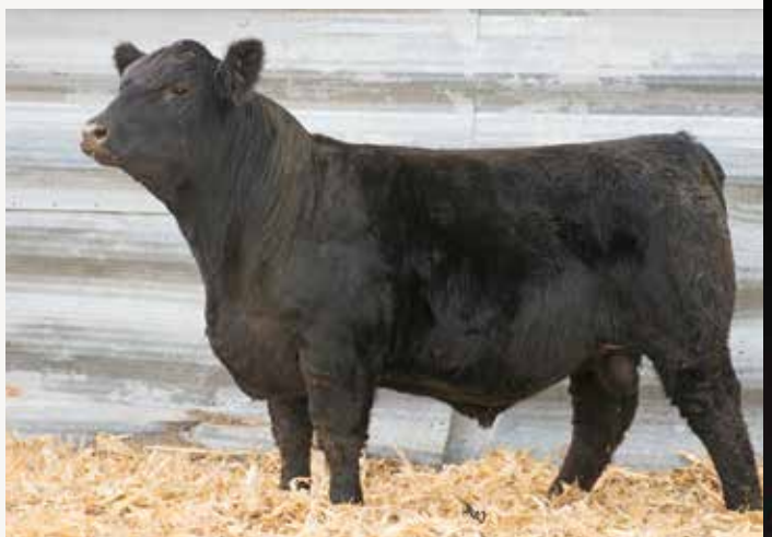
SS Overload F20

Good looking Pay the Price son out of a Boyd New Day cow that doesn't miss. The Price bull sure made a splash winning Denver 2 years in a row. Fault free bull here with a super pedigree.