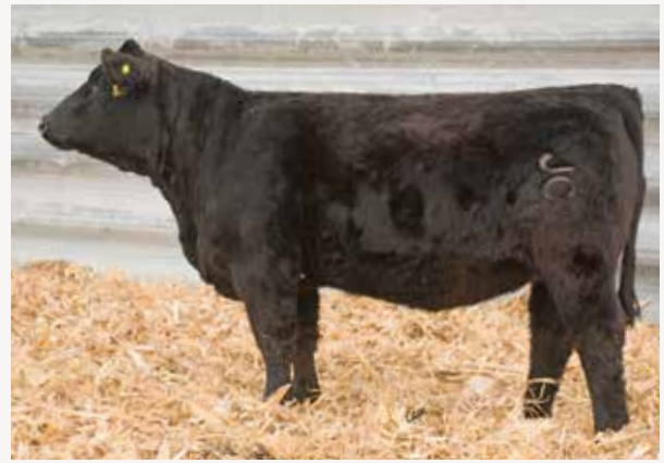
J&C Ms Innovator G228

An Innovator out of a top cow family here at J&C. Really wide top and thick ended for a fancy show heifer that is broke to show.