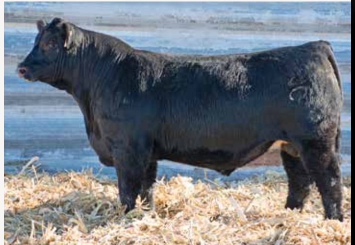
J&C Hoover Dam G400

All black Hoover Dam that is a complete package that is fault free, with awesome feet and leg structure, plenty of body length as well as thickness.