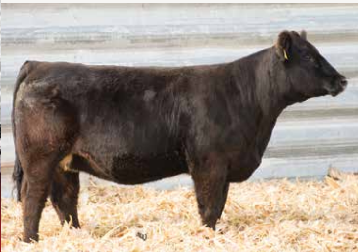
J&C Ms Uno Mas F369

Planned Mating - 15 • --2.7 • 75 • 107 • 7 • 18 • 55 • 33 • -0.27 • 0.31 • -0.07 • 0.6 • 137 • 80