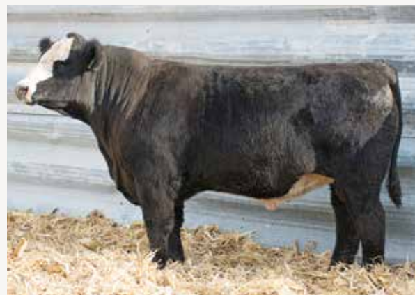
JWS Freddy F715

This big baldy bull is stout and rugged. He will sure add pounds and length to your calf crop. His mother is one of my favorite cows out of my most successful donors. Just look at the open heifer I am selling in this sale as Lot 161, she is out of this bulls grandam.