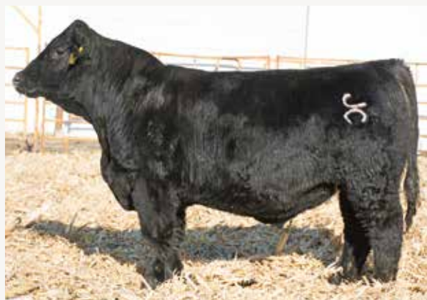
J&C Discovery G10