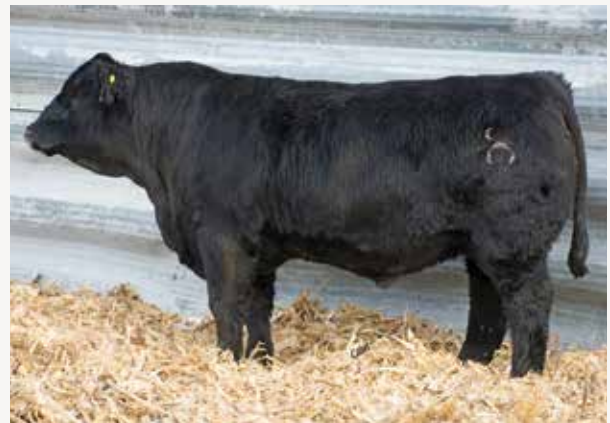
J&C Wide Range G454

All black Hoover Dam that is a complete package that is fault free, with awesome feet and leg structure, plenty of body length as well as thickness.