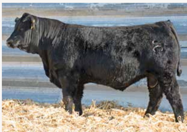
J&C Boulder G522

All black Fortune 500 that you'll like for his overall balance of frame, muscle and correctness. He is thick made and easy moving.