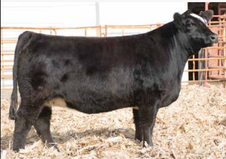
J&C Ms Uno Mas F146

Planned Mating - 12 • --0.7 • 80 • 117 • 6 • 18 • 57 • 38 • -0.25 • 0.20 • -0.06 • 0.66 • 127 • 78