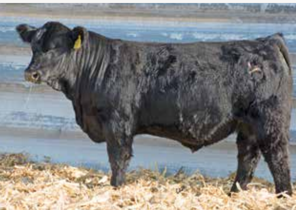
J&C Longhaul/411C G371

All black Mr. Western that is thick, deep and straight topped.