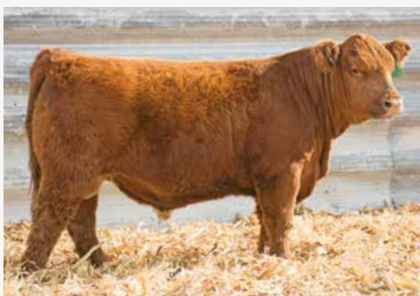
SS Franchise 81F