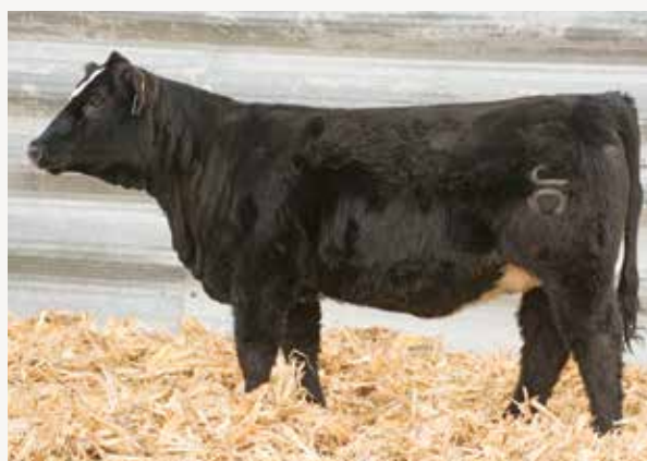
J&C Ms Lucy/411C G813

By our Longhaul/Lucy son that does a great job here. He makes them pretty with plenty of substance and thickness.