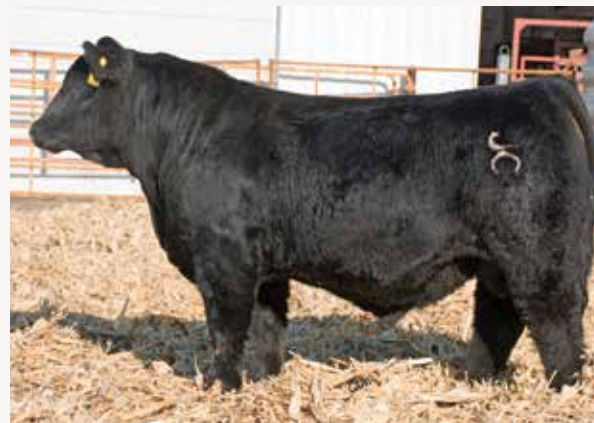
J&C Innocent G914

A really fancy Innocent Man out of the Z869 donor that has lots of thickness from end to end, all in a really attractive package.