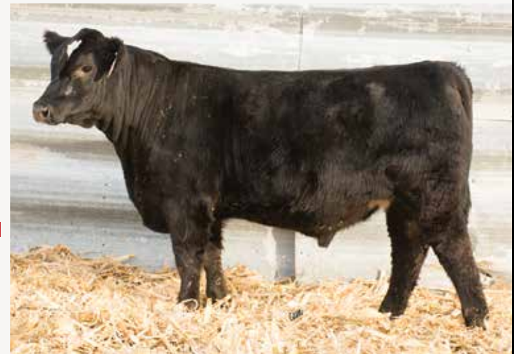
R/F Anchor G717

This star headed bull is out of my favorite first calf heifer on the farm. He is an Anchor son you like from any angle. He's long, deep, stout hiped and extra wide from behind. It is hard to build them this stout and sound while being this good-looking up front. Another calving ease deluxe bull that will stamp his progeny with a good build, a little extra muscle and a killer look. His calves will hit the ground running and gain well to put money back in your pocket. Don't miss him.