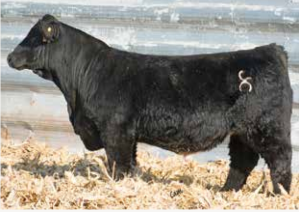
J&C Innocent Man G921

A long bodied, fancy fronted bull by Innocent Man out of the Z869 donor. He's big hipped, long necked and level topped.