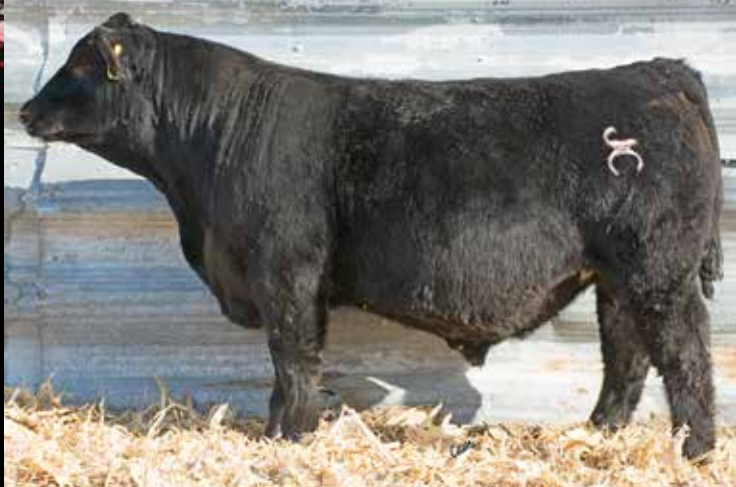
J&C Lockdown G411