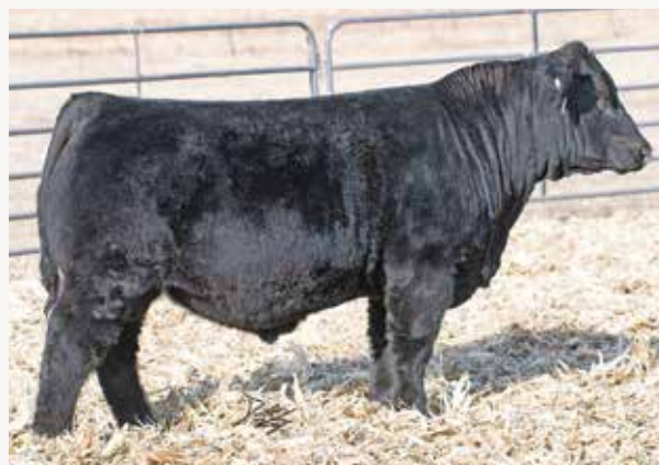
NPC Gifford G914