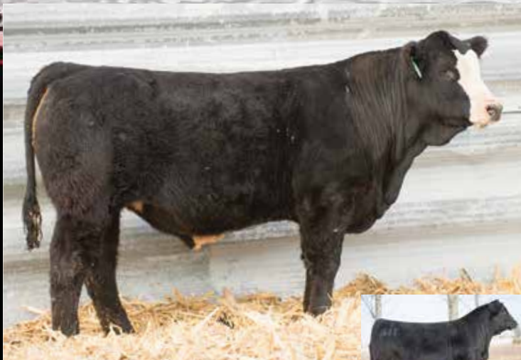
WS Mr Turnpike G36