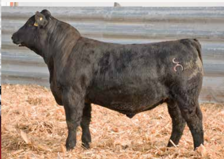
J&C Boulder G808