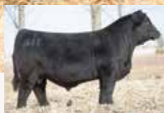
Rubys Turnpike 771E- reference sire