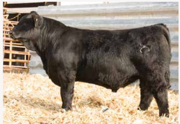
J&C Jack G909

All black bull by E726, a Jack Around son, that has a real smooth exterior with lots of thickness and freedom of movement.