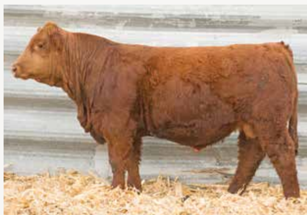
SS Fortified F93

These Cowboy Cut bulls are really impressive. SS Top Cut is one to add to your short list.