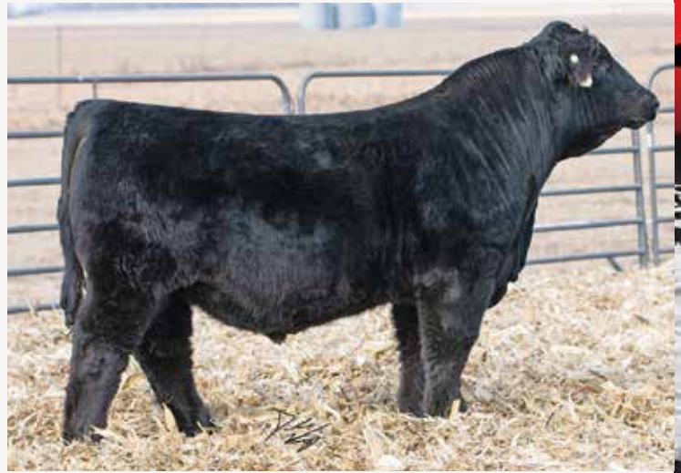
NPC Ivan G902