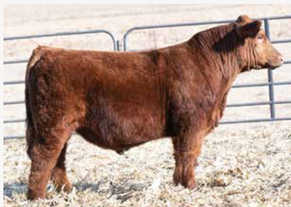
NPC Franklin F856

This stylish red bull has a long-squared hip to go with his big foot, bone, and overall power. He is a November bull so with his extra maturity he should be able to cover a few more cows than most yearling bulls.