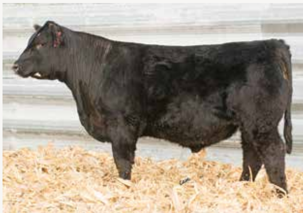
Zeis 457 G129