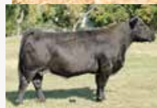
SVF NJC Magnetic Ldy M25 - reference dam

Overload is one of my favorite consignments. This powerful, solid black, Cowboy Cut son is very impressive.