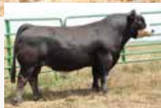
W/C Pinnacle E80- reference sire