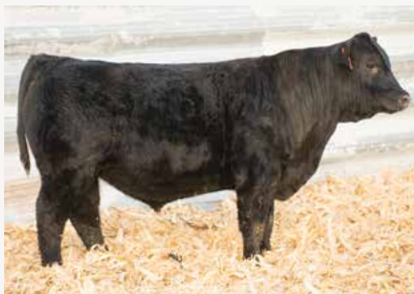
Zeis Stepping Stone G79