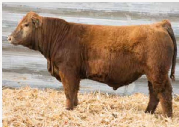
SS Foreman 650G

Foreman is a red Fully Loaded son out of an excellent Cottontail daughter.