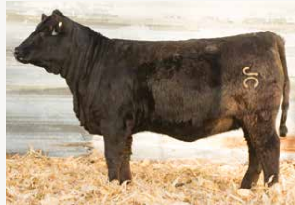
J&C Ms Judge G974

A big bodied Judge heifer with tons of capacity and performance. She's got a great look as well as being clean fronted, level topped and big from behind.