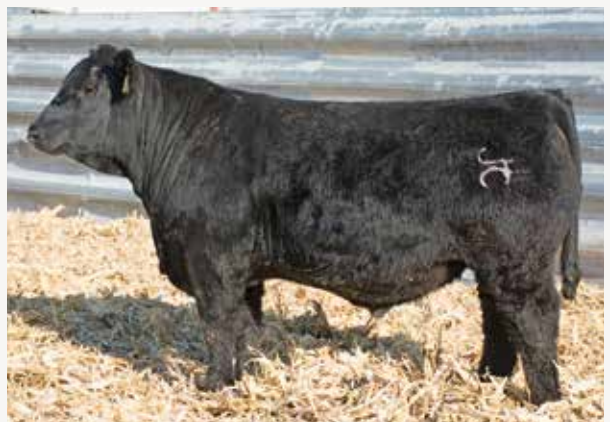
J&C Innovator G675

All black Innovator out of a top High Regard daughter that has all the tools. He's long bodied, cool fronted, and thick with a great set of wheels and easy to be around.