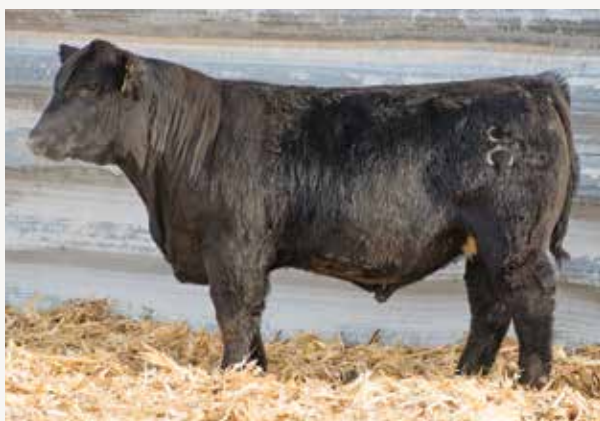
J&C Real Steel G071