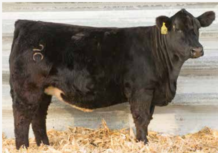
J&C Ms Innovator G916