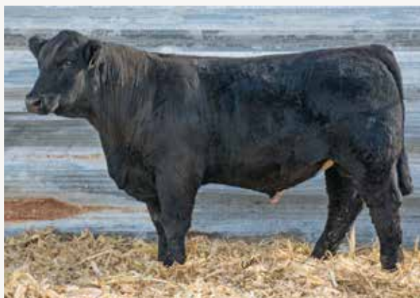
JWS Francis F910

This is a complete bull with sound structure. He is a good doing kind of bull that you will want to keep the heifers he sires. He is out of one of my most consistent producers.