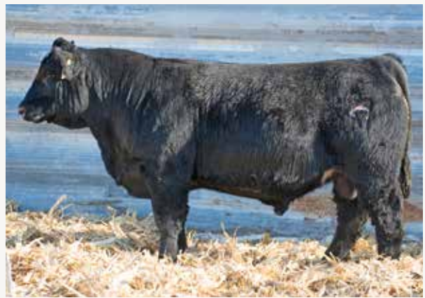
J&C Fortune 500 G43

All black Fortune 500 that is square hipped, deep sided and heavy boned.