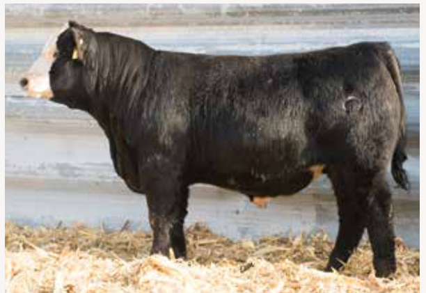
J&C Lockdown G881

A blaze face baldy by Lock Down that's got a square hip and level top with plenty of guts.