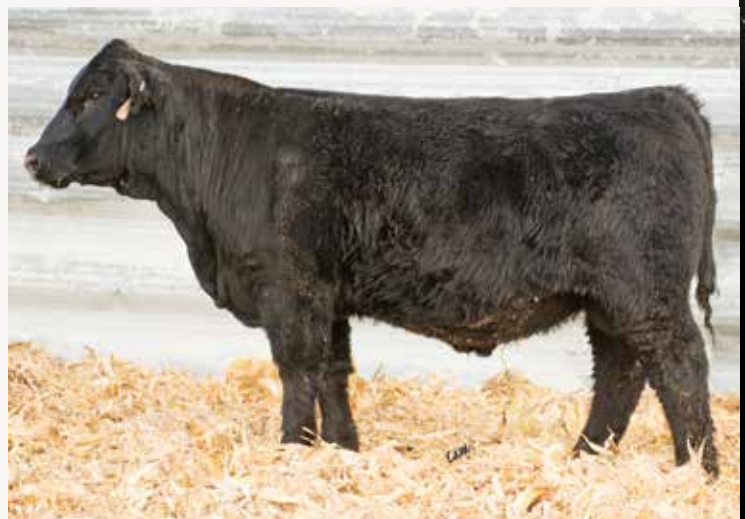
R/F Bottomline G214

- This guy's mamma could possibly be the best purebred cow that resides at Riley Farms. G214 is not the EST bull, however he does not disappoint in any one category. He is an up headed, good built, balanced individual that is loose in his skeleton. He has plenty of depth and body, a generous amount of spread over his top and he is stout and square from behind. Moderate and usable kind of cattle here. In terms of buying a bull that won't make a throw away, I think he makes the short list.