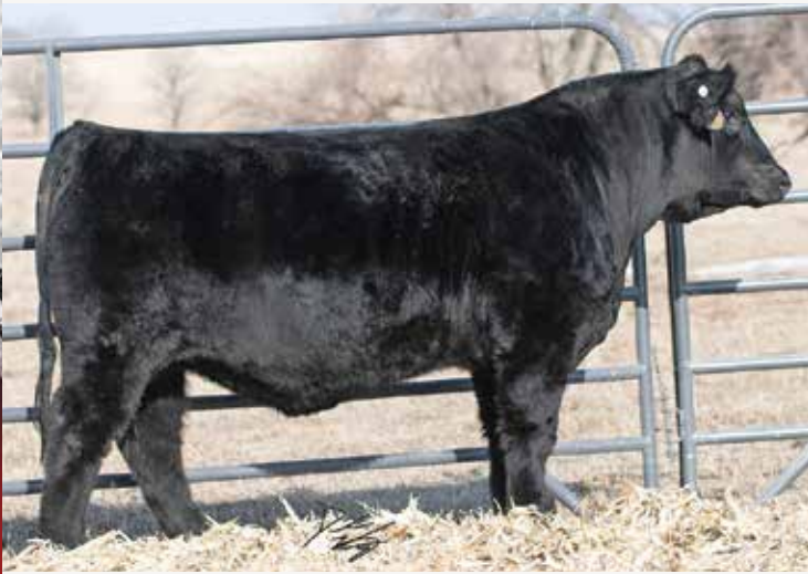
NPC Grant G906

Lot 102 J&C Boulder G226 1/2 SM 1/2 AN Black Polled Bull Calved 1/12/19 Tattoo J&C G226 ASA# 3654651 Hoover Dam CCR Boulder 1339A CCR Ms L Taylor 1339Y Puetts/J&C Zoom Zoom G L F Erica 226 GeneSeek – Homozygous Black J&C Ms Zoom D226