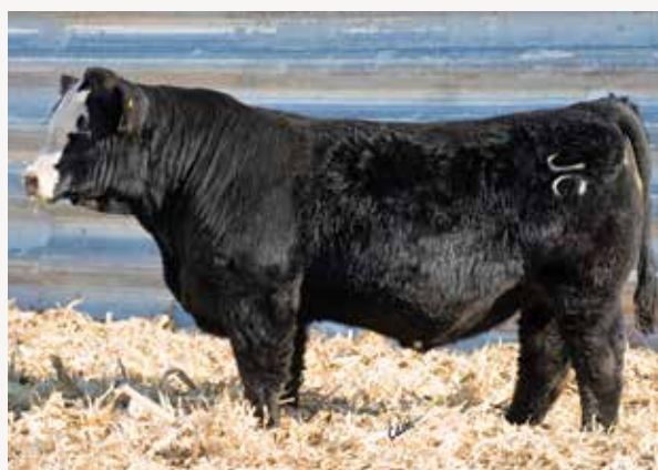
J&C Relentless G922

A baldy by Relentless out of our proven donor T85. He leaves little doubt as to why we flush this cow still to this day. He's a raggedly constructed, big hipped bull with a long stride and eye appeal.