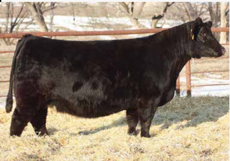
W/C Miss Werning A343 - reference dam

Purebred baldy bull out of Ruby's Turnpike 771E and WS Ms Black Y101. She has produced a lot of great bulls for Walsh Simmentals. His is easy on the eyes and structurally well balanced. You don't want to miss out on this well made bull with a cow family like his. He is sure to pass on growth and style to his calves.