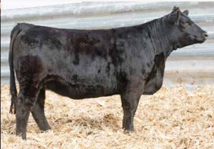
J&C Ms Jack Around E462