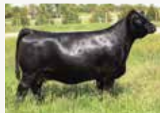
Miss Werning KP 8543U- reference granddam