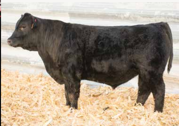
Zeis Stepping Stone G159