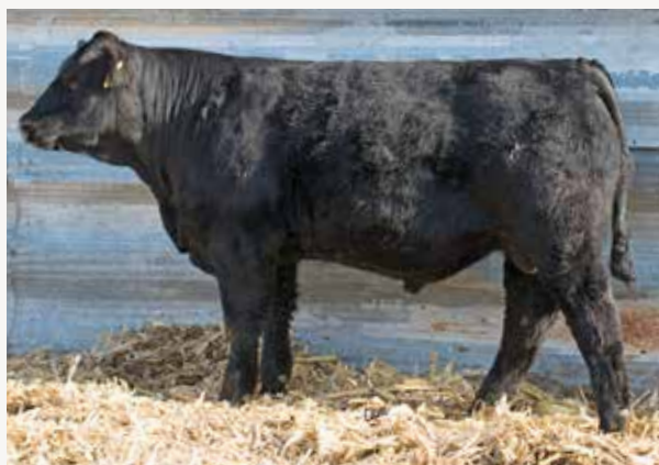
J&C Judge G615