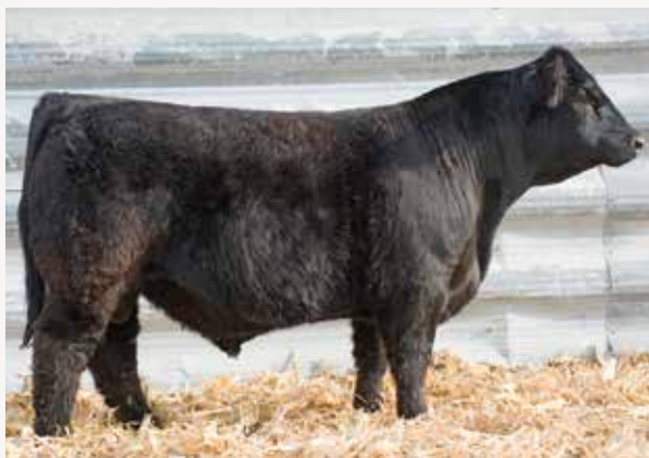
SS Steel Force 50F