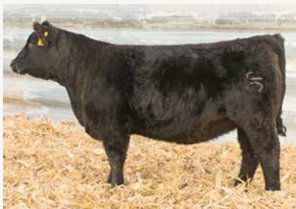
J&C Ms Innovator G618