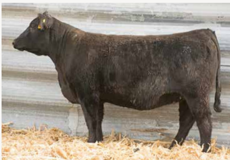
J&C Ms Spec Focus F520

Planned Mating - 16 • -2.3 • 67 • 101 • 9 • 29 • 62 • 33 • -0.08 • 0.49 • -0.01 • 0.49 • 149 • 80