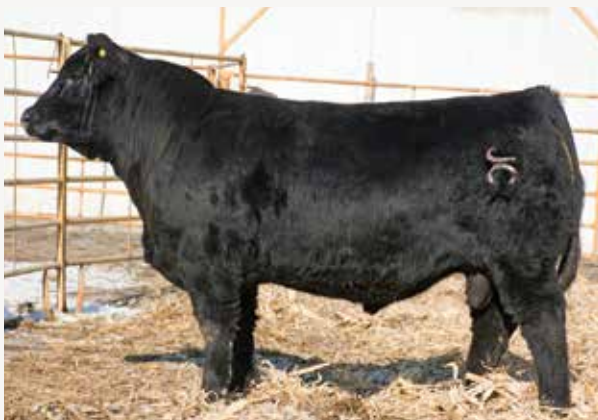
J&C Boulder G064