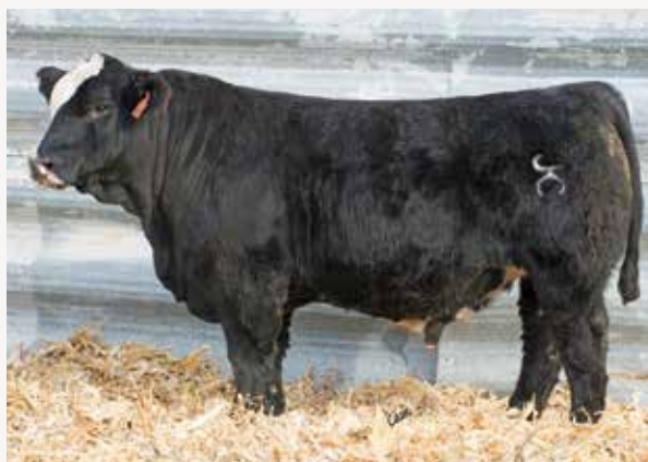
J&C Cash Flow G551

A baldy eye appealing Cash Flow son with a cool front, big topline and huge behind. A real eye catcher and good on the move as well.