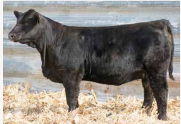
J&C Ms Judge G759

Out of a Broker daughter and sired by SFG Judge, this heifer is truly outstanding in her performance and phenotype. A big bodied, all black heifer that is thick and deep with plenty of eye appeal.