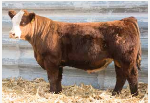
J&C Lockdown G882

A dark red baldy by Lock Down. This bull wanted to be black but didn't cook long enough. So he's a really cool fronted red baldy that's got a cool front end, a big top and great hip on a big back end.