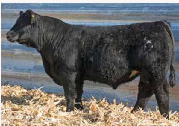
J&C Lockdown G052