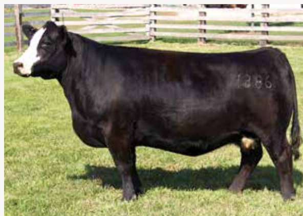
Sandeen Donna 7386 - reference dam

High Regard is an ET, solid black bull out of Loaded Up and Donna. Donna is the dam of Upper Class. Outstanding genetics!