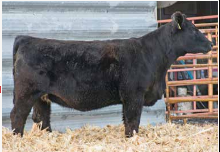
J&C Ms Innocent F759

AI to TJ Frosty 318E, ASA#3288449 on 4/17/19 PE to TJ 393F, ASA#3459256 from 5/5/19 to 8/1/19 Planned Mating -15 • -0.8 • 72 • 110 • 9 • 27 • 63 • 36 • -0.18 • 0.39 • -0.04 • 0.63 • 143 • 79