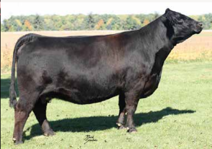
Miss Knockout 74T - reference granddam