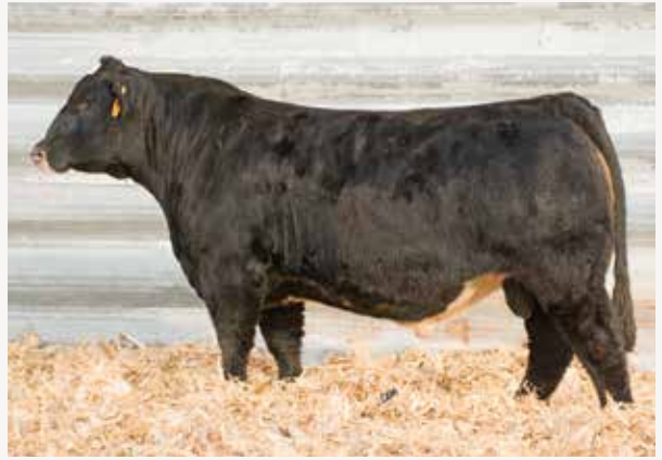
R/F Uptown F053

This bulls dam has outdone herself on our farm—she has repeatedly laid down and had one of the best calves on the place, year in-year out. This dude is square built, powerful in his design, sound on his extremities and he is sure to catch your eye in the