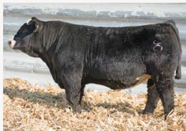
J&C Mr Innovator G910