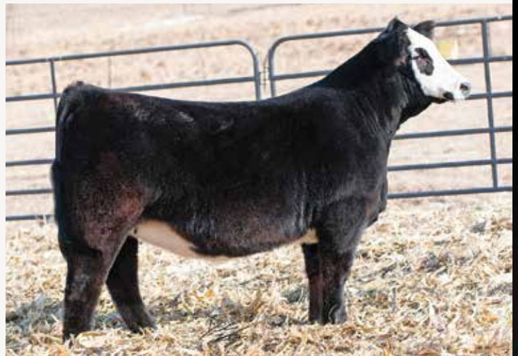
JWS Minnie G6

Where do I begin with this heifer? If you are looking for a dead broke one that has no holes in her, this is it. She definitely needs someone to drag her around Grand Island this summer at the Simmental Junior National show. She has been a standout since day one and won't disappoint.