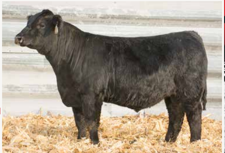
R/F Anchor G907

- This bull has always been a favorite around home. When you talk performance, build, balance and longevity, this guy checks all the boxes. Low maintenance, good looking and masculine. I am certain his calves will come easy and grow fast! What more could you want in a breeding bull? This calving ease deluxe is ready to cover cows. Be sure to have him marked.