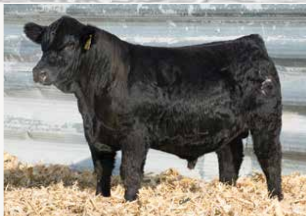
J&C Overhaul G30