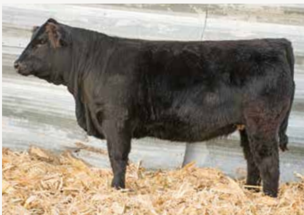
J&C Ms Fortune G20