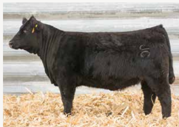
J&C Ms Boulder G021

A cool made Boulder heifer that is easy on the eyes. She's deep sided and wide from end to end.