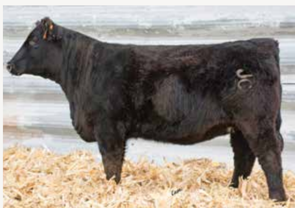
J&C Ms Innovator G07