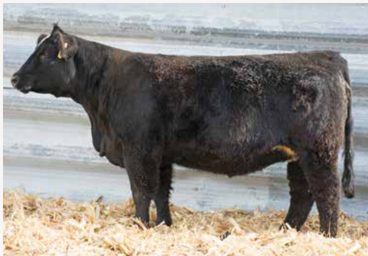
J&C Miss Bighaul F78

Planned Mating - 12 • -0.5 • 72 • 105 • 7 • 26 • 62 • 38 • -0.22 • 0.3 • -0.05 • 0.71 • 134 • 75