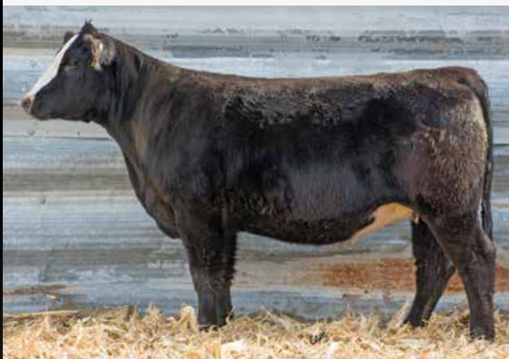
J&C Ms Longhaul F32