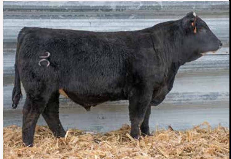
J&C Lockdown G50

All black Judge out of a Hard Core x 772 daughter that is well put together with lots of body depth and thickness.