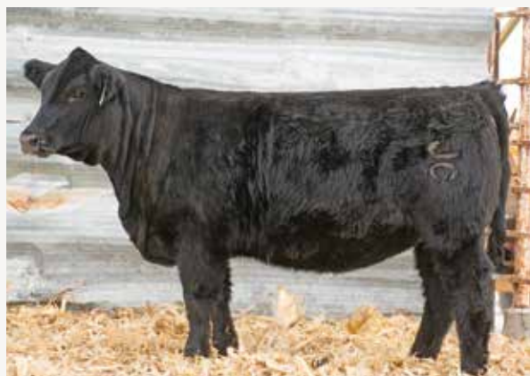
J&C Ms Discovery G462

A Discovery daughter that is thick ended, clean fronted, and correct.