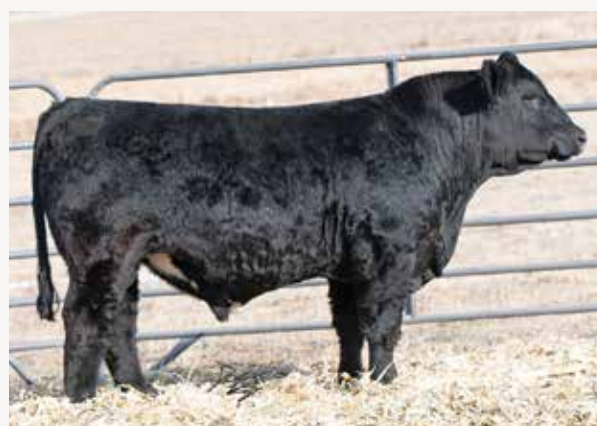
NPC Greyson G908

All black Discovery that's really thick and pretty fronted.