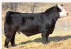
W/C Loaded Up 1119Y-reference sire