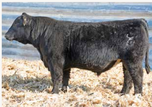
J&C Innovator G229