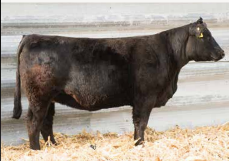
J&C Ms Overhaul F179

Planned Mating - 13 • -0.15 • 70 • 105 • 6 • 27 • 62 • 32 • -0.3 • 0.26 • -0.06 • 0.77 • 127 • 74