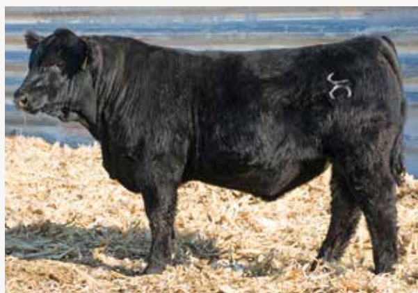
J&C Exec Order G223