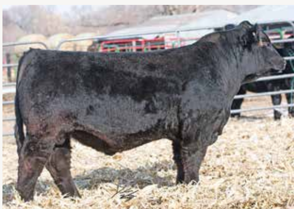
NPC Graham G915