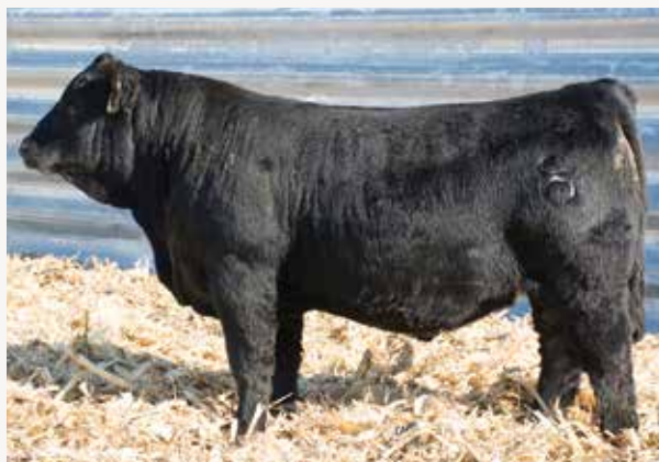
J&C Fortune 500 G883