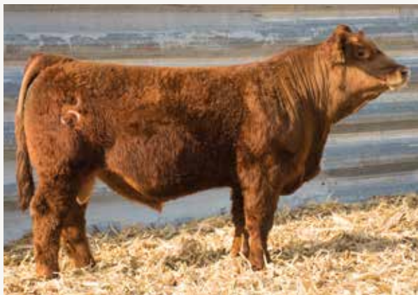
J&C Lockdown G239