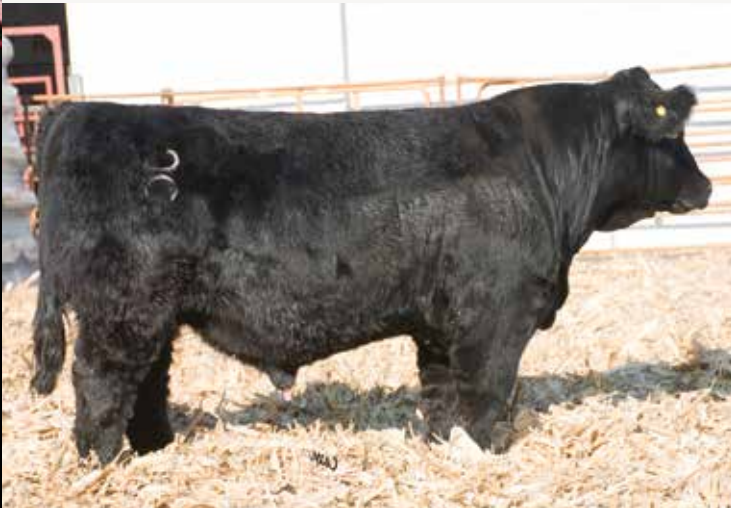
J&C Hoover Dam G043