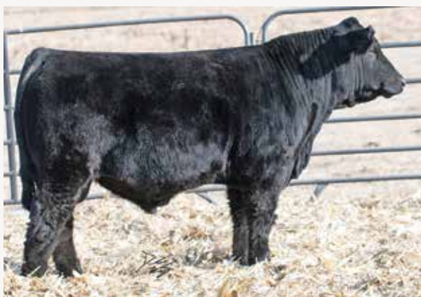
NPC Gale G905