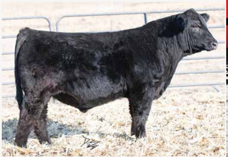
BF NP G927

This has a very intriguing pedigree. He is out of the hottest sire right now Relentless, and his mother is a full sister to Chopper. His prodigy will have the look and style to compete in the show ring but still hang some great numbers.