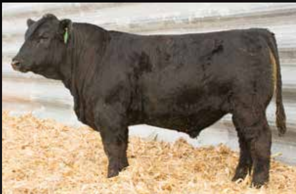
F93N – Mr CCF 20-20 x KenCo Miss Shimmer 14RB