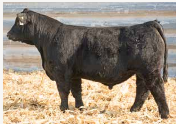
J&C Judge G625

Boulder that is straight topped and thick ended.