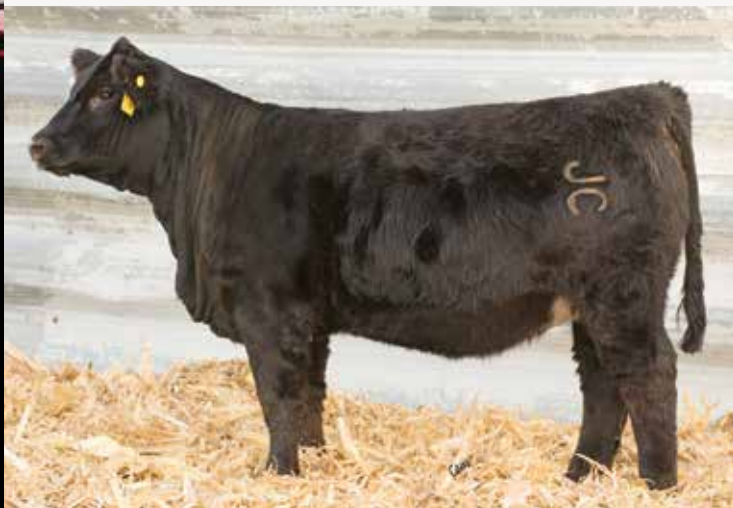
J&C Ms Western G4