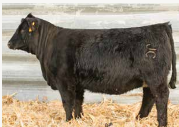
J&C Ms Romeo G002

A deep bodied, soggy made heifer that has lots of flex and softness to her stride.