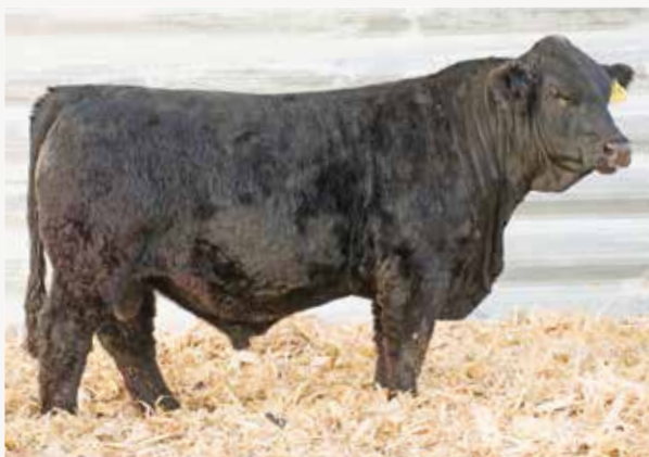
NXT/SHS Upscale Pays 2