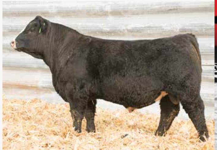
SS Insight F231

SS Insight is a big and rugged baldy. Insight mated to our Simmental cows really works well. Check out this bull on sale day!