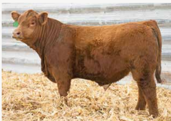
SS Outlaw F09C

SS Bandit is a big, rugged, baldy, Cowboy Cut son.