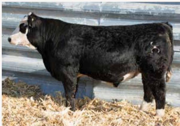
J&C Lockdown G230