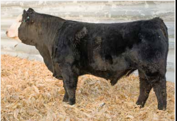
WS Pinnacle G7

Purebred baldy bull out of W/C Pinnacle E80. Who happens to be the full brother to W/C Bankroll 811D. This bull has the length, depth, bone and soundness that is sure to pass on the power and pedigree to his offspring that will pack on the pounds.