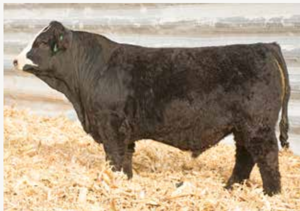
SS Bandit 15F