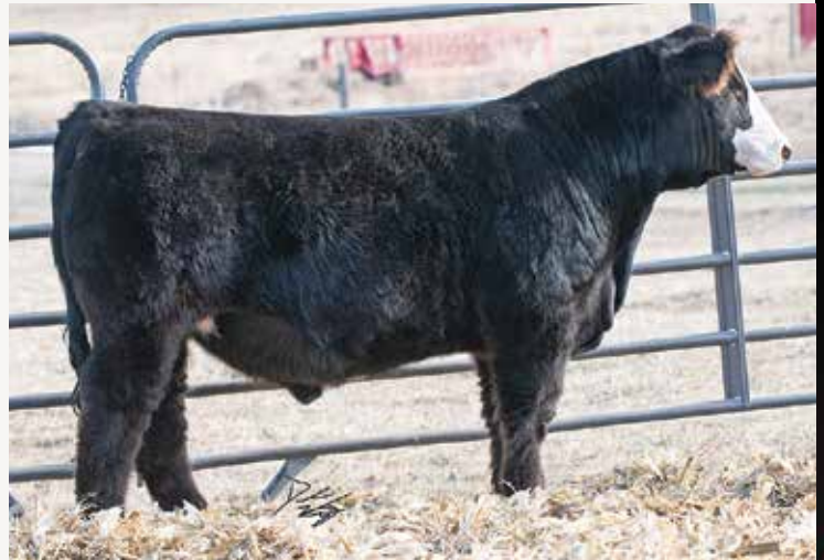
NPC Gavin G929

Gavin is a purebred Relentless son out of a Dew It Right cow that goes back to our Lucky Gal matriarch cow. He is soft footed, massive topped, and big boned. He has great neck extension and a yearling weight over 1300 pounds. From what we can see all of our Relentless sons have been consistent with their look and style.