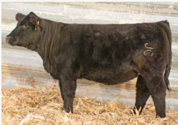
J&C Ms Western G932