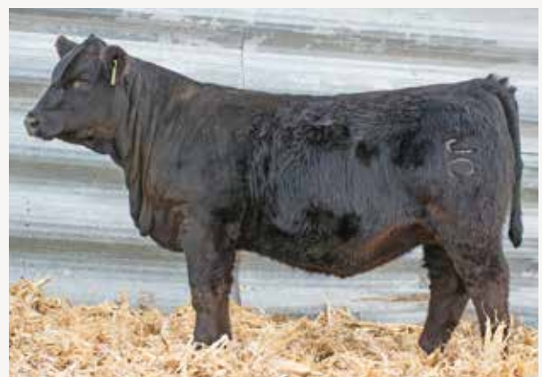
J&C Ms Judge G865

Another Judge heifer that has a ton of body depth and extra thickness. Her dam is a Step Up out of the Z862 donor, who is a Dew It Right x Magnetic lady. Lots of cow power here.