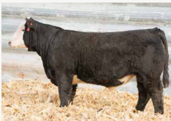
Zeis Jacked Up G319

A baldy 3/4 jacked up son that is long fronted and possesses a lot of style and eye catching look. Top 20% for weaning and yearly growth EPDs and backed by one of the great cow families in Simmental history. This one had the material strength top and bottom.