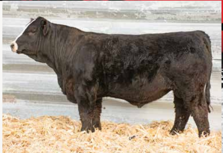
Zeis Cowboy G109

If you are searching for a baldy PB that excels in all facets of the industry be sure to look this guy up. His top 10% API is sure to make him a cowherd improver, poi's the fact that he is sure good looking and sound. His dams sire is a full sib to Driver.