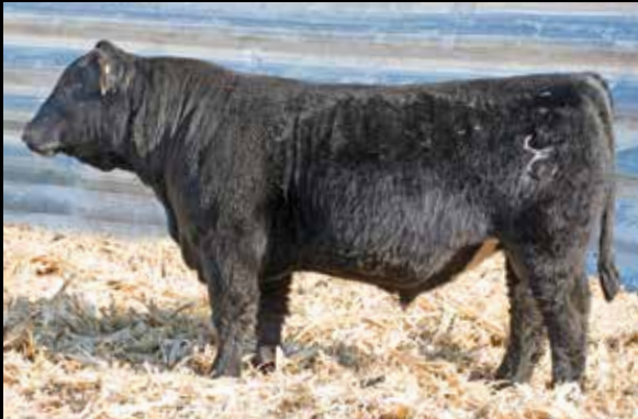
G229 – CDI Innovator 325D x J&C Ms Innocent C224