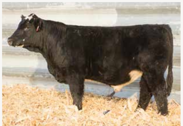
J&C Jacked Up G359

This big bodied baldy has really turned it on since weaning time, turning in a 1400 lb Adj yearling weight. His BC lookout dam is one of my favorites and has done an outstanding job year after year. This bull will sire excellent growth traits and leave some awesome replacements.