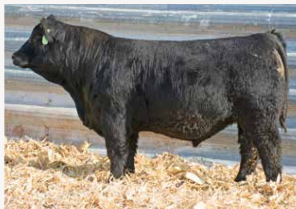
SS Top Cut 008F

Outlaw is an excellent Fully Loaded son that will surely add extra pounds to your calf crop.