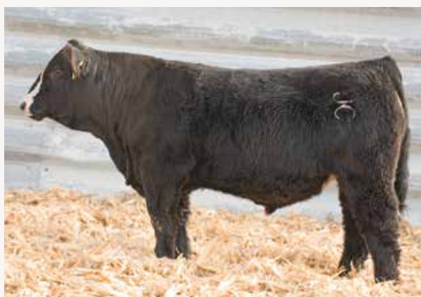
J&C Innocent Man G917

All black Boulder out of a Wide Track cow with plenty of growth. He's long bodied and easy moving with neat joints.