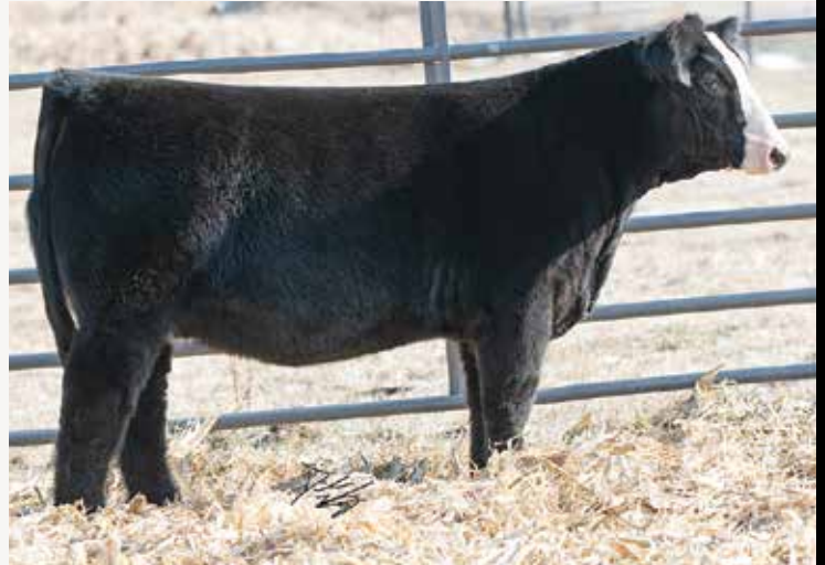
NPC Gia G935

This little baldy has been a surprise for day one. She is out of a first calf heifer that we were going to sell as a bred heifer last year on the New Direction sale but the vet said she didn't stick to her due date. We kept her back because we do not sell bred heifers that are bull bred. The vet was wrong! This is a 20-20 daughter out of a Jack Around x Perfection cow. It has been fun watching this young show heifer calf grow up.