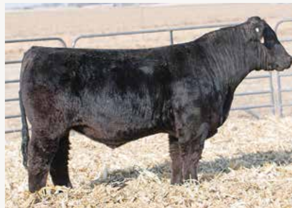
NPC George G909

G909 is a long sleek front ended Purebred bull. To go along with this great front end is his extreme soundness and square hip. He is chalked full of meat weighing in at 1200 pounds.