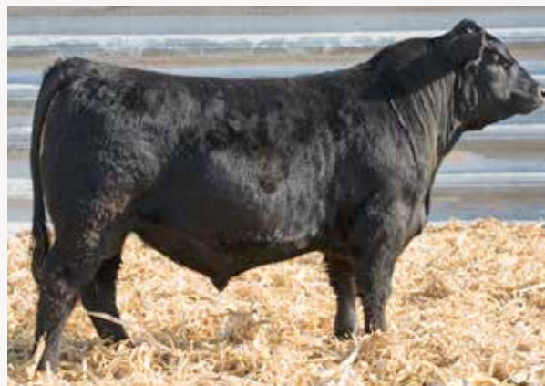
SS Joker F52