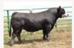
W/C Pinnacle E80- reference sire