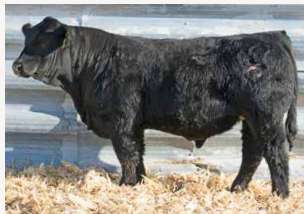
J&C Exec Order G861