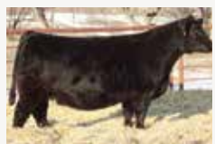
W/C Miss Werning A343-reference dam

Purebred baldy out of the great W/C Miss Werning A343 donor! She is a maternal sister to the ever so famous 8543U donor for Werning Cattle Company. This bull brings the power from Front to back along with the extra fancy eye appeal. He looks just like his daddy more and more everyday W/C Loaded Up 1119Y who sold for $240,000 for 1/2 interest. I believe he will go on to produce just like him. Producing length and thickness that is sure to pack on the pounds. His daughters will be the ones you will want to keep, as they will be extremely feminine and structurally correct to go on and make amazing cows. The maternal strengths represented in this pedigree will put this outstanding stud on the short list for every cattlemen! Retaining 1/3 semen interest.