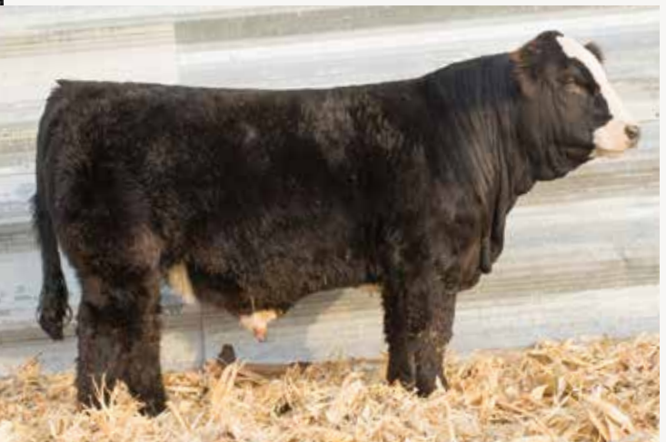
WS Pinnacle G62

Purebred bull out of the great w/c miss Werning A343 donor. Material sister to the great 8543U donor for Werning Cattle Company. This bull is easy on the eyes and super sound and structurally made. His daughters will be feminine and great replacements. Great udder quality and milking ability. Great solid black bull here that comes from an amazing cow family.