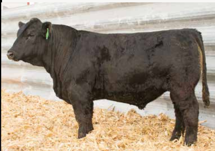
SS Renegade F93N

A tremendous Lockdown bull out of a first calver that has tons of middle, a big behind and lots of bone. A really cool individual.