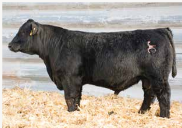
J&C Boulder G807