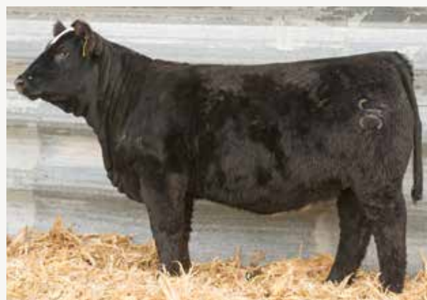
J&C Ms Criminal G536