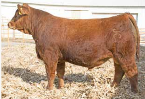
J&C Executive Order G227