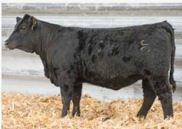
J&C Ms Discovery G718