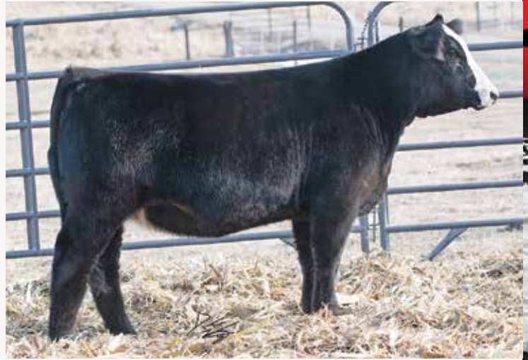
NPC Gwyn G932

Gwyn is a beautiful baldy heifer out of Pays to Believe full brother. Her mother is an Uprising out of the Perfection S116 cow. We feel she will have a great show carrier but importantly have son or daughter that will make you money.