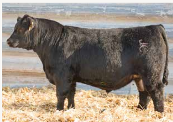
J&C Lockdown G066

All black Judge out of a Turning Point cow with lots of shape to his quarter and hip with a neat neck/shoulder junction and wide top.