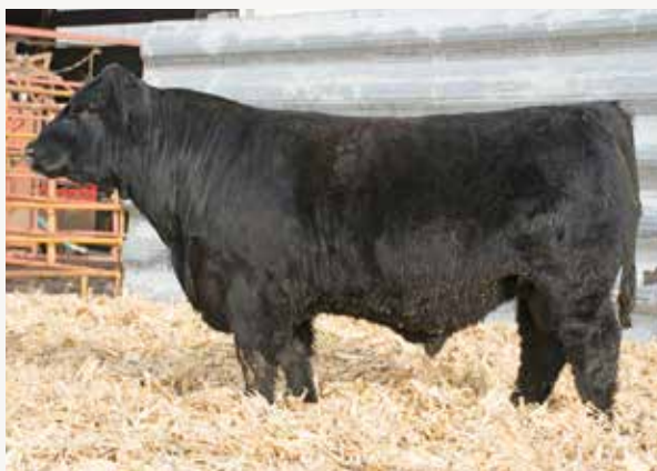
SS Trailblazer F713

Trailblazer is a stout made, Fully Loaded son, out of a top producing cow. Fully Loaded has done a tremendous job for us, and here is a good example.