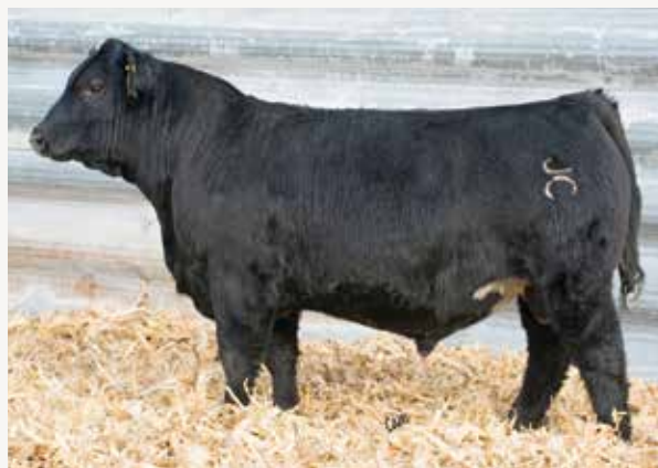
J&C Boulder G238

A ton of rib and guts in this thick ended Boulder son. He is heavy weight with lots of muscle.