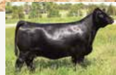
Miss Werning KP 8543U- reference granddam