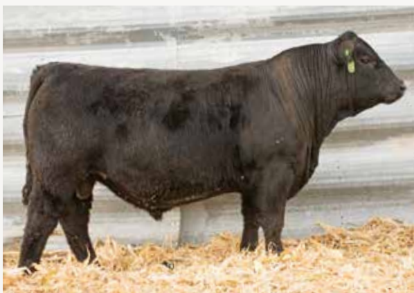
SS Prime Cut F683