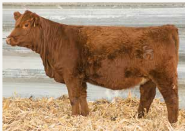
J&C Pendleton G918