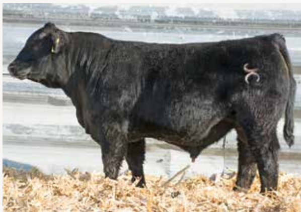
J&C Wide Range G225