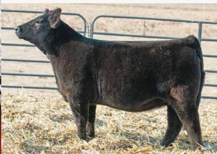
NPC Valorie G913

A Real Steel daughter you'll like for her structure and overall balance. She's clean fronted and long sided.