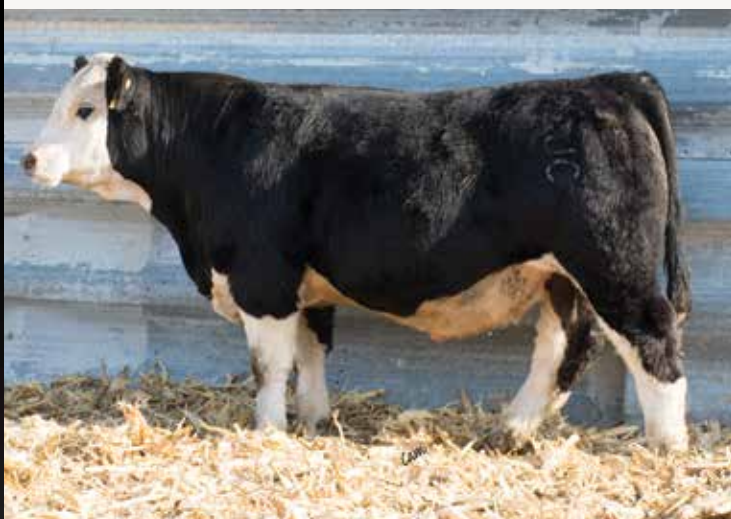
J&C Lockdown G614

All black Boulder that's really deep bodied and free moving.