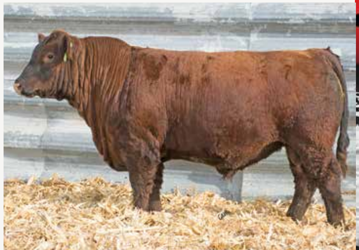
SS Crimson F401

If you like them deep dark cherry red, SS Crimson is the bull for your program. Crimson is sired by Fully Loaded, and out of a registered Angus cow.