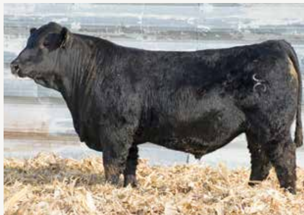
J&C Judge G461

A big bodied, thick ended SFG Judge son that you'll like for his growth EPDs and his actual performance. With an 88 BW, WW 782, YW 1512 are all outstanding with a ton of spread from birth to yearling.