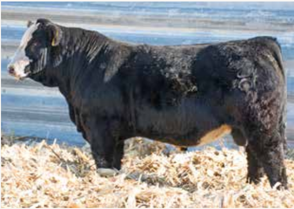
J&C Innocent Man G919

A blaze face Innocent Man out of the Z869 donor. He's got a great look with a smooth shoulder, level top and square hip.