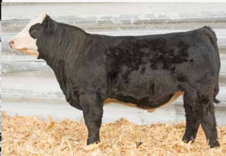
FPC Loaded Up 1219G

Renegade is a powerful, solid black, 20/20 son. He will cover a few extra cows for you.