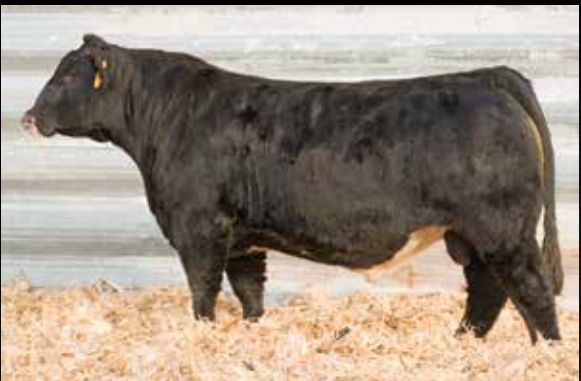
F053 – R/F Downtown B64 x CMFM Told You So 053B