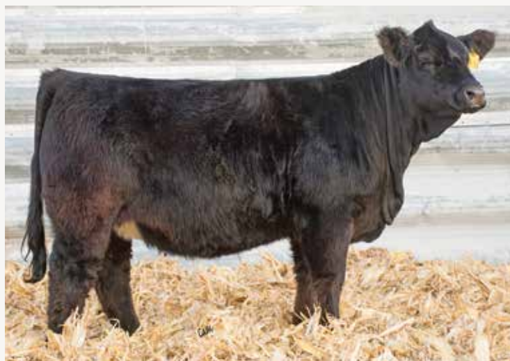
J&C Ms Fortune 500 G43

A top prospect by Fortune 500 that has been shown. Very easy to handle and kid broke.