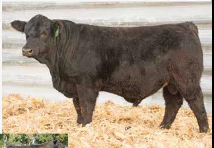
SS Milestone FM25

Milestone is one of our top consignments. He is an ET son out of the legendary Magnetic Lady cow. Tremendous genetics!