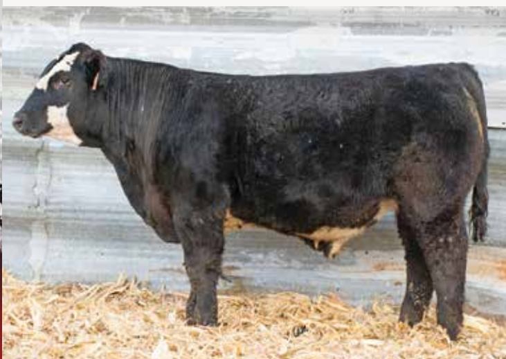
Zeis Lockdown G209

This Blackhawk son puts it all together in terms of his genetic profile and overall completeness and quality. A true spread bull that will calve and sire extra pounds at weaning and yearling. Not to mention the convenience tracts of udder quality, disposition and soundness in his maternal lineage.